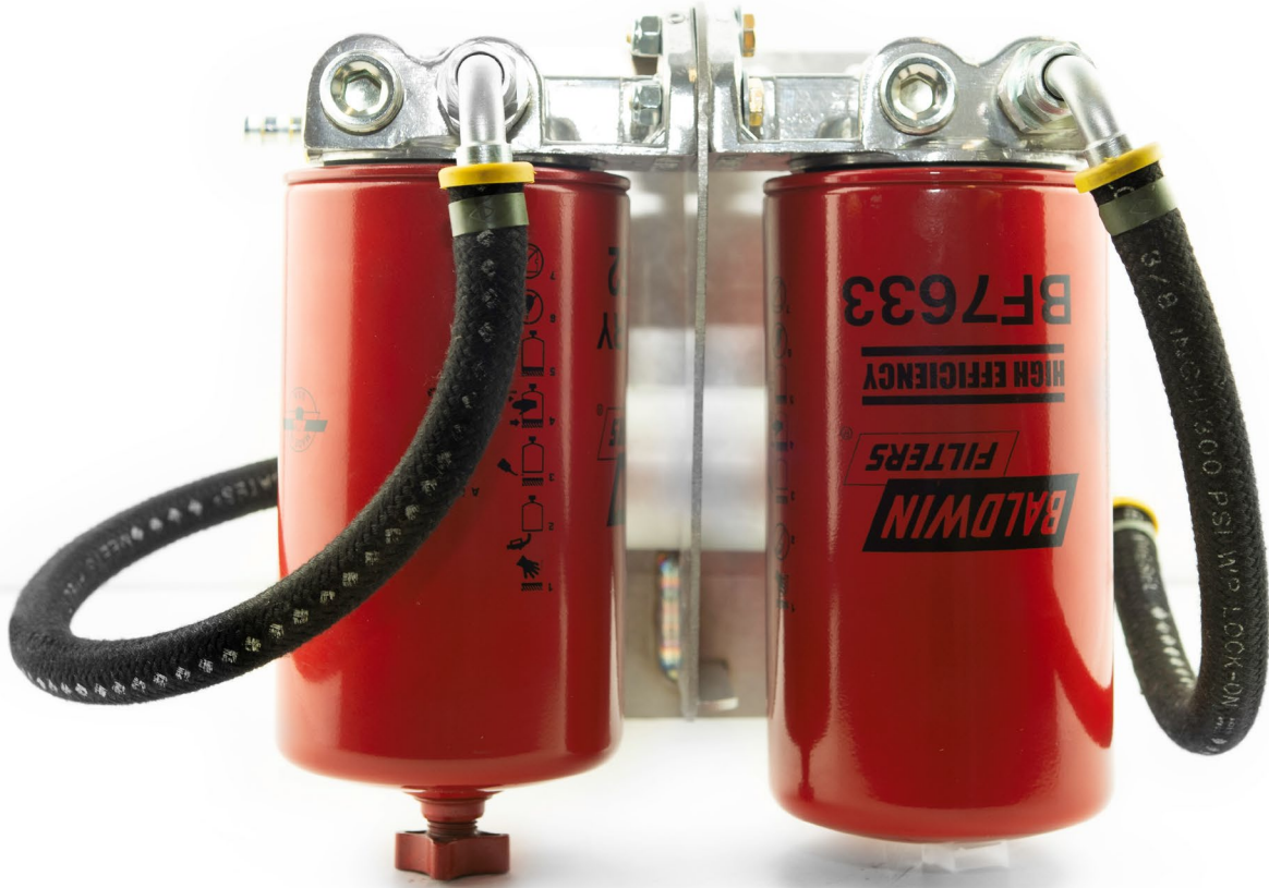
Figure 2 – “Inside the Frame” Orientation – Pump Inlet on Left – Pump Outlet on Right